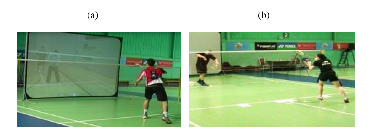
Figure 1. Set-up for (a) video-based simulation sessions and (b) the field-based session.

During acquisition, the training groups received instruction on the areas of the opponent's body that they should fixate vision upon, along with examples of the "gold standard" visual search. Moreover, during the acquisition sessions, the HA group practiced with stressors present, whereas the LA group did not and the CON did not participate in the acquisition sessions. A mobile eye registration system was worn throughout to measure visual search fixation locations (number, location and duration). The rating scale (RSME) (Krane, 1994) and the Mental Readiness Form v3 (MRF-3) (Zijlstra, 1993) were used to measure cognitive effort and state anxiety, respectively. Anticipation judgment accuracy (RA) and visual fixations (location, number and duration) were analysed in ANOVA.