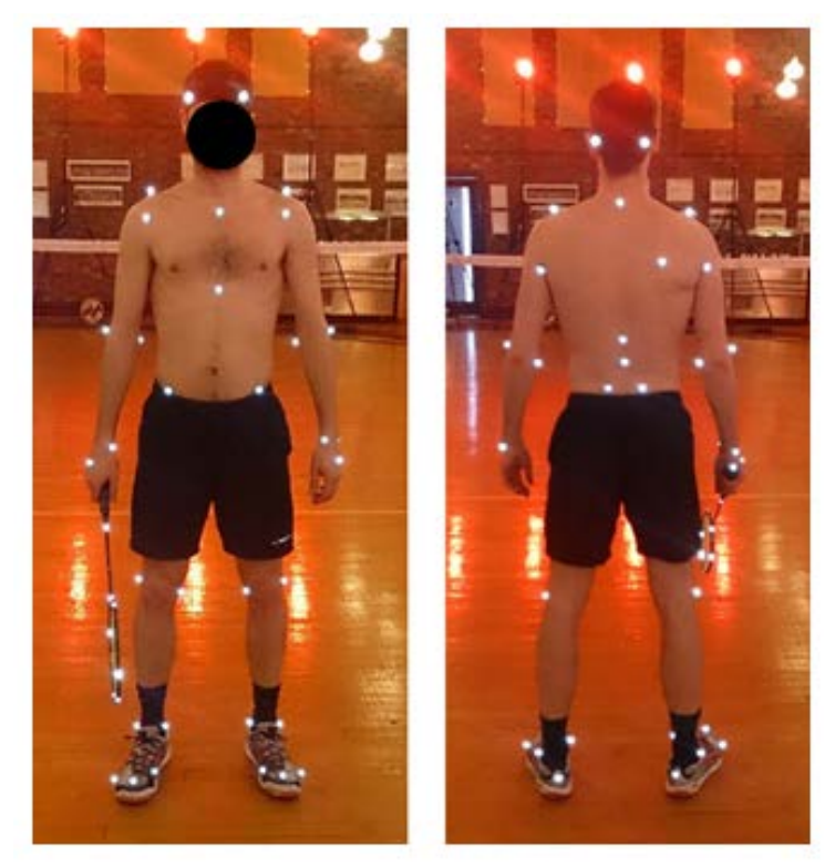
Figure 1. Subject with markers attached ready for data collection.

An 18 camera Vicon Motion Analysis System (OMG Plc., Oxford, UK), operating at 400 Hz, was used to record kinematic data. The camera set-up was positioned to include the half of the court that the participant was performing in, approximately 7 \times 6 \times 3 m. Forty-four 14 mm retroreflective markers were positioned over bony landmarks in accordance with a marker set developed specifically for this project (Figure 1). The players used their own racket for the data collection. Each racket was fitted with seven strips of retro-reflective tape plus a marker on the base of the racket (Figure 2) and Yonex AS40 shuttles were used with a strip of retro-reflective tape attached to the base of the shuttle (Figure 2).