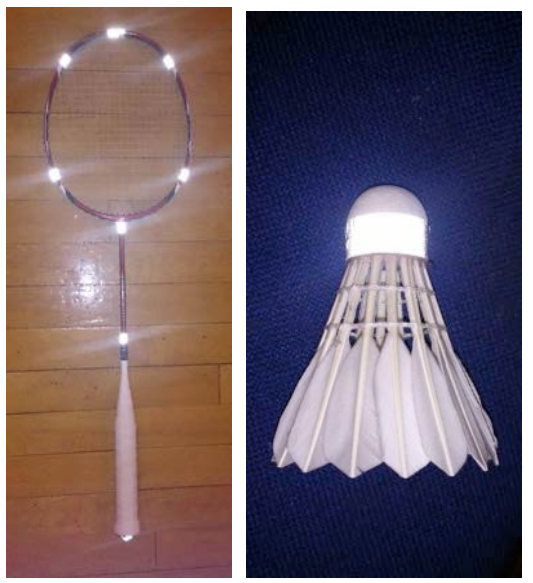
Figure 2. The location of the reflective tape on the racket and shuttle.

For each trial three key instants were identified; the preparation (prep), end of retraction (ER), and shuttle contact (SC). The instant of preparation was identified as when the knee angle was most flexed prior to jumping. The instant of ER was identified by the lowest vertical position of the racket in the backswing. The instant of SC was identified as the frame where the shuttle and racket were closest. Kinematic data were filtered using a fourth order Butterworth filter (double–pass) with a low pass cut off frequency (with the exception of the shuttle which was left as raw data points and fitted using a curve – see below). The determination of cut- off frequency to use was compromise between the amount of signal distortion and the amount of noise allowed through Winter (1990). A cut-off frequency of 30 Hz was chosen to be applied to all marker positions; this reduced the noise in the velocities and accelerations but made little difference to the position of the markers. Curves were fit separately to the pre- and post- impact phases (identified from the change in anterior-posterior direction) of the shuttlecock coordinate data in the vertical, anterior-posterior, and medio-lateral; planes in accordance to Equation 1 (McErlain-Naylor et al., 2015).